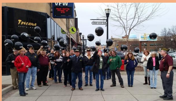
Missing Man Balloon Release...2015