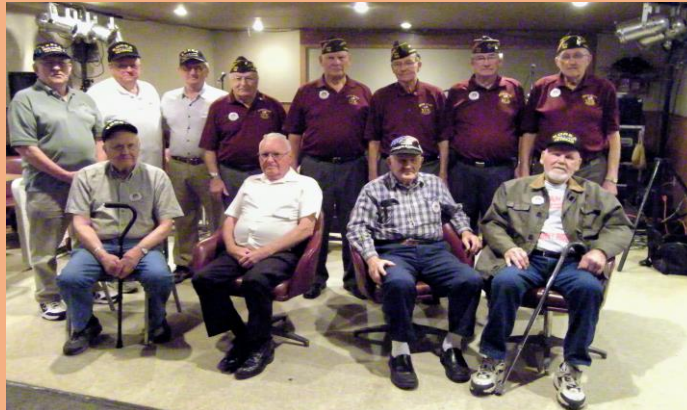
Celebration of the 60 th Korean War Anniversary...July 27...2013