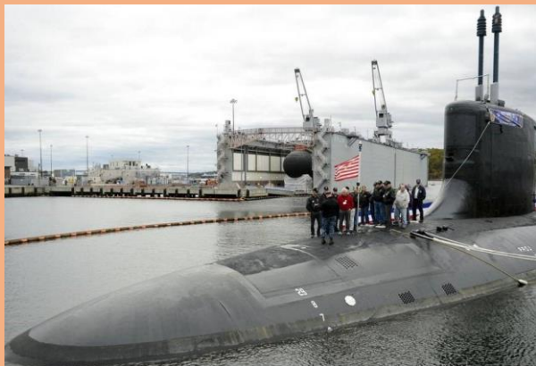
Honor Guard on the USS-ND....Oct 2014