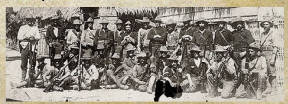
The original Young's Scouts (26 men) at Baliuag, Bulacan Province on May 11, 1899.

With 11 other scouts, without waiting for the supporting battalion to aid them or to get into a position to do so, charged over a distance of about 150 yards and completely routed about 300 of the enemy, who were in line and in a position that could only be carried by a frontal attack.