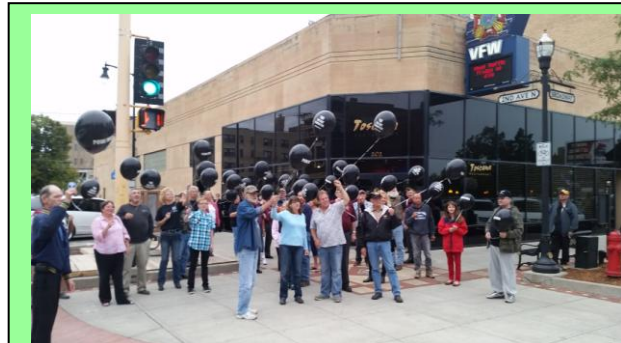
POW/MIA Balloon release after the ceremony